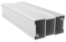
Aluminium profile 80x45 mm